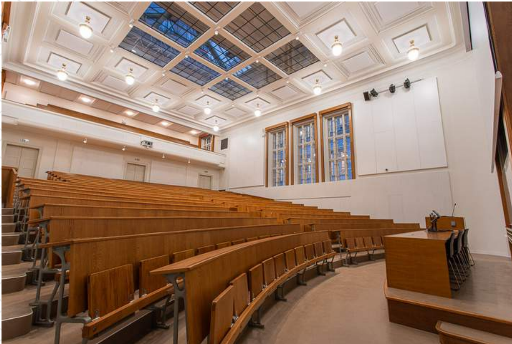
Great Auditorium (room P131)