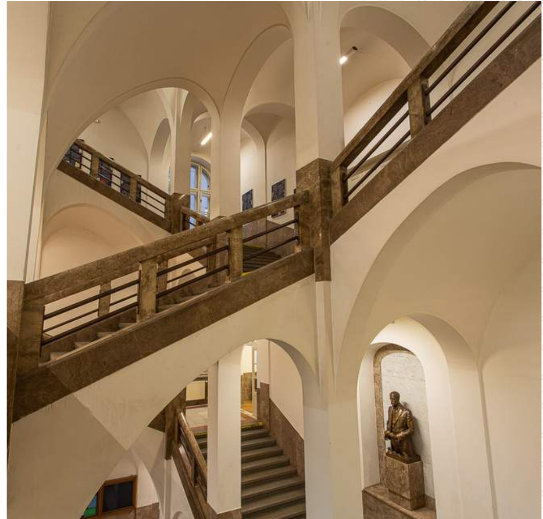
Common areas of the main building of CU FA