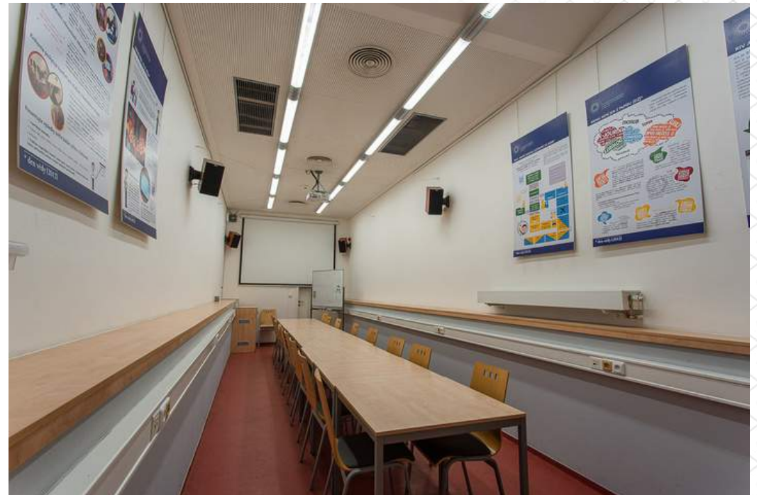
Teamwork Study Room

slightly tiered seating ensuring good visibility, a beautiful view of the Prague Castle