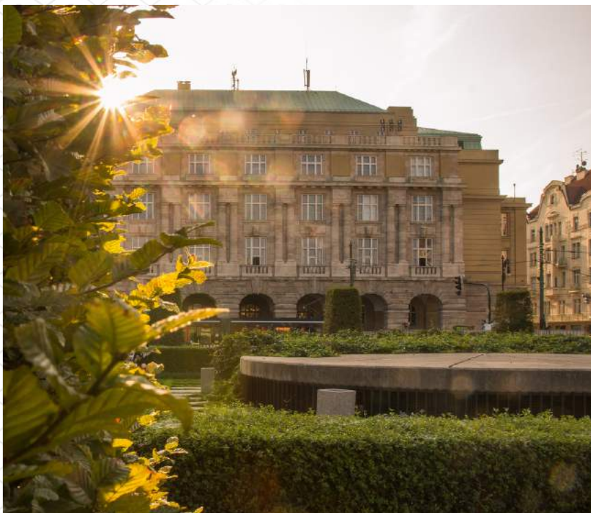
The main building of CU FA