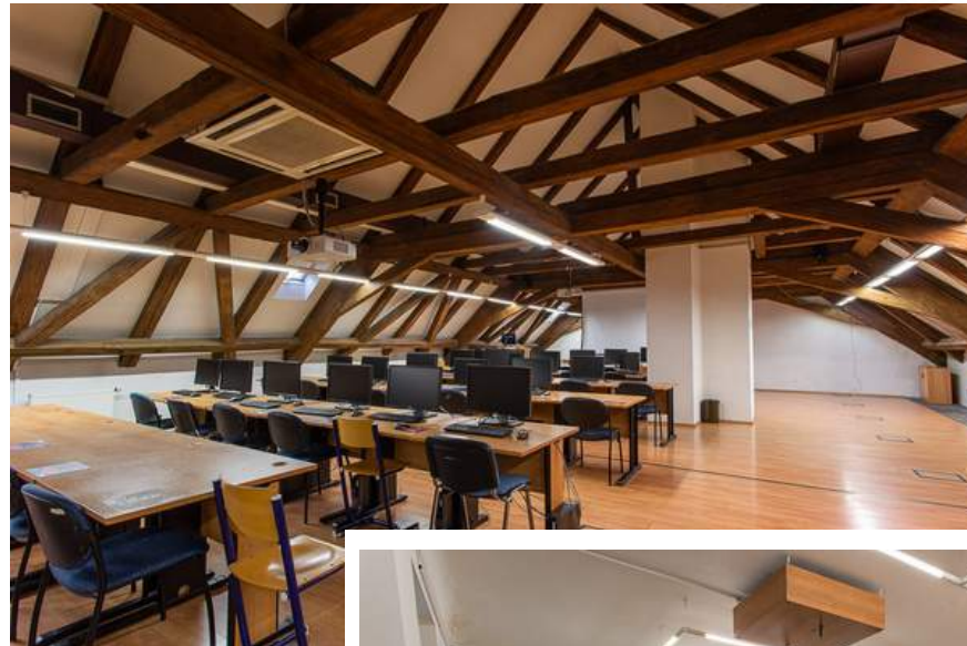
Attic, Seminar rooms

In the vicinity of the building, there are many restaurants, bistros, etc., of various types and price levels.