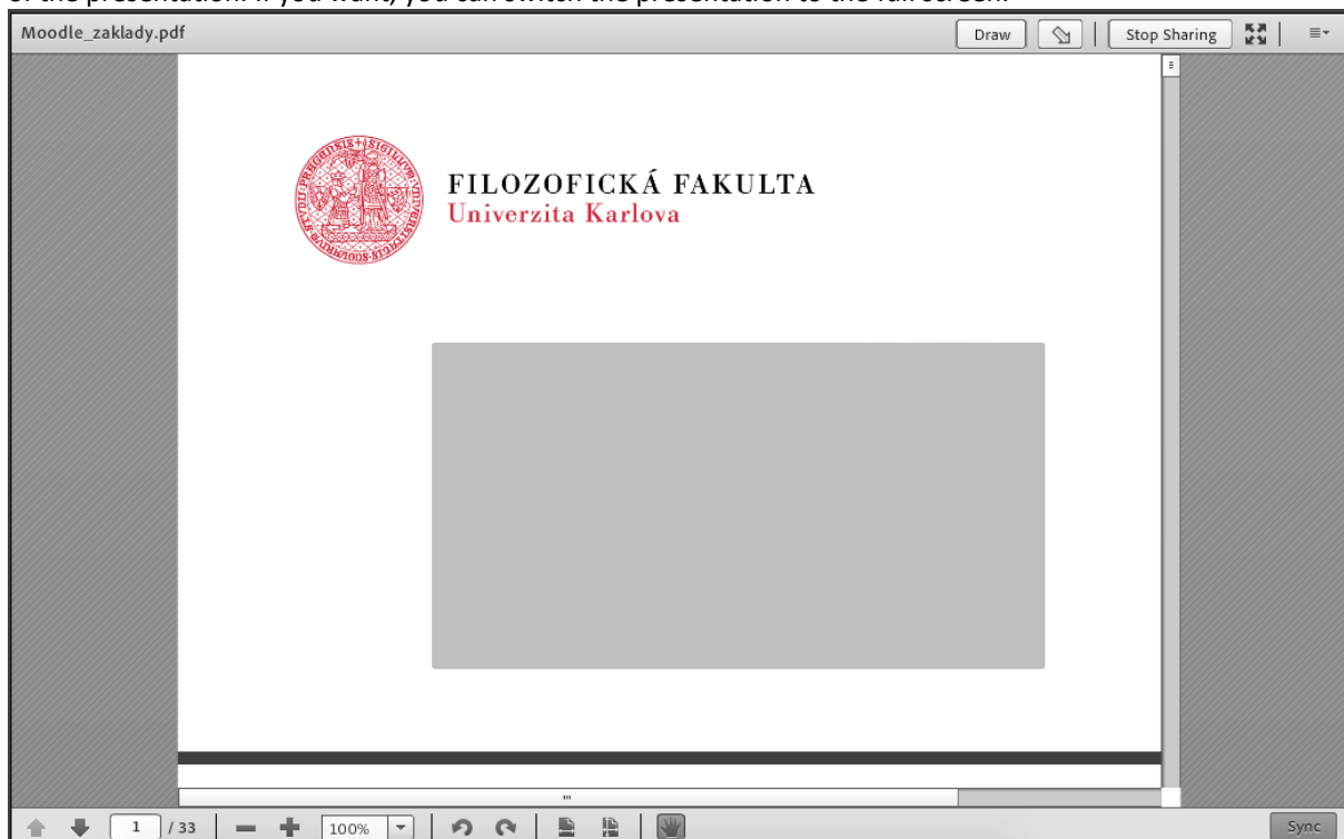
Pic. 2.: Shared pdf document

You may also draw or use a pointer in a shared presentation, and you can, obviously, browse through the pages of the presentation. If you want, you can switch the presentation to the full screen.