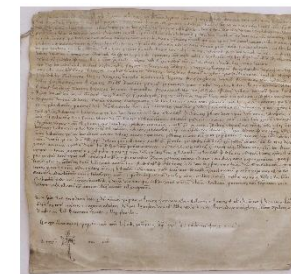
Archivio di Stato di Siena, Diplomatico , San Salvatore Monte Amiata, 5 agosto 1240

PEUPLEMENT ET TRANSFORMATION DE L’HABITAT EN EUROPE DANS LES SOURCES ÉCRITES ET LA DOCUMENTATION ARCHÉOLOGIQUE (11 E – 14 E SIÈCLE)